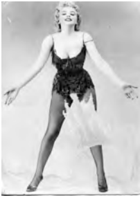
Figure 2: Original photograph of Marilyn Monroe, 1956.

When brought to the rough earthenware, the sister figures of Monroe continue the complex representations of femininity as the outlines of Monroe's body have been strengthened by rugged, scratchy marks. The marks have been carved as a part of the wet ceramic surface. The smooth feminine shapes have thus acquired new lines, which are partly atop the original lines, and partly pushed under the original ones. Even though its serial nature is one of the central features of this work, each of the plates is also meaningful, as they all embody different representations of femininity.