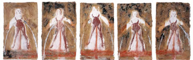
Figure 1: Mäkelä's work Monthly Bleeding , 1996, silkscreen and painting to Finnish earthenware.

During the study, the artist-researcher updated culturally tied representations of femininity. By playing with already existing female representations and printing them on clay, in this way, Mäkelä brought them into a new context and participated in their reproduction and re-contextualisation. For example, in the first exhibition, she interrogated the experience of femininity by using the post-modern device of loaned images. In the series of clay pictures appointed with the name Monthly Bleeding (Fig. 1) the photograph of Marilyn Monroe is used as a starting point of the work (Fig. 2).